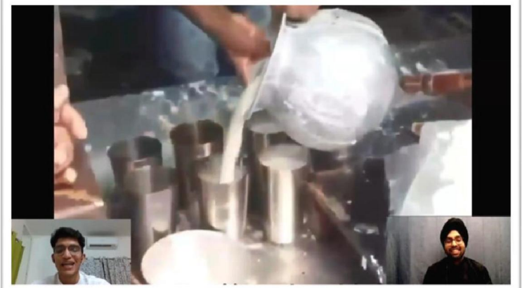
Snippets of the actual video. In frame, food prep from a famous outlet.