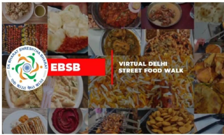
First episode of Virtual Delhi Street Food Walk organized by IHM Pusa under Ek Bharat Shreshtha Bharat on 15th July, 2020.