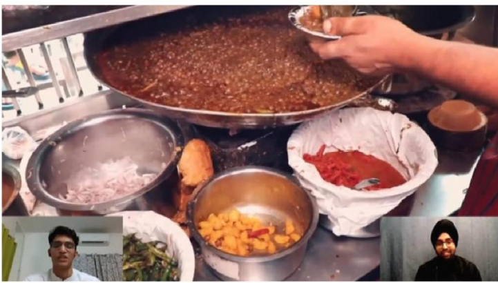
Snippets of the actual video. In frame, food prep from a famous outlet.